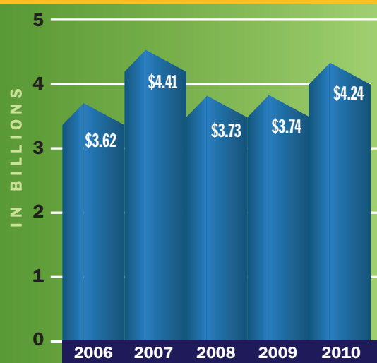
Fund Market Value as of September 30