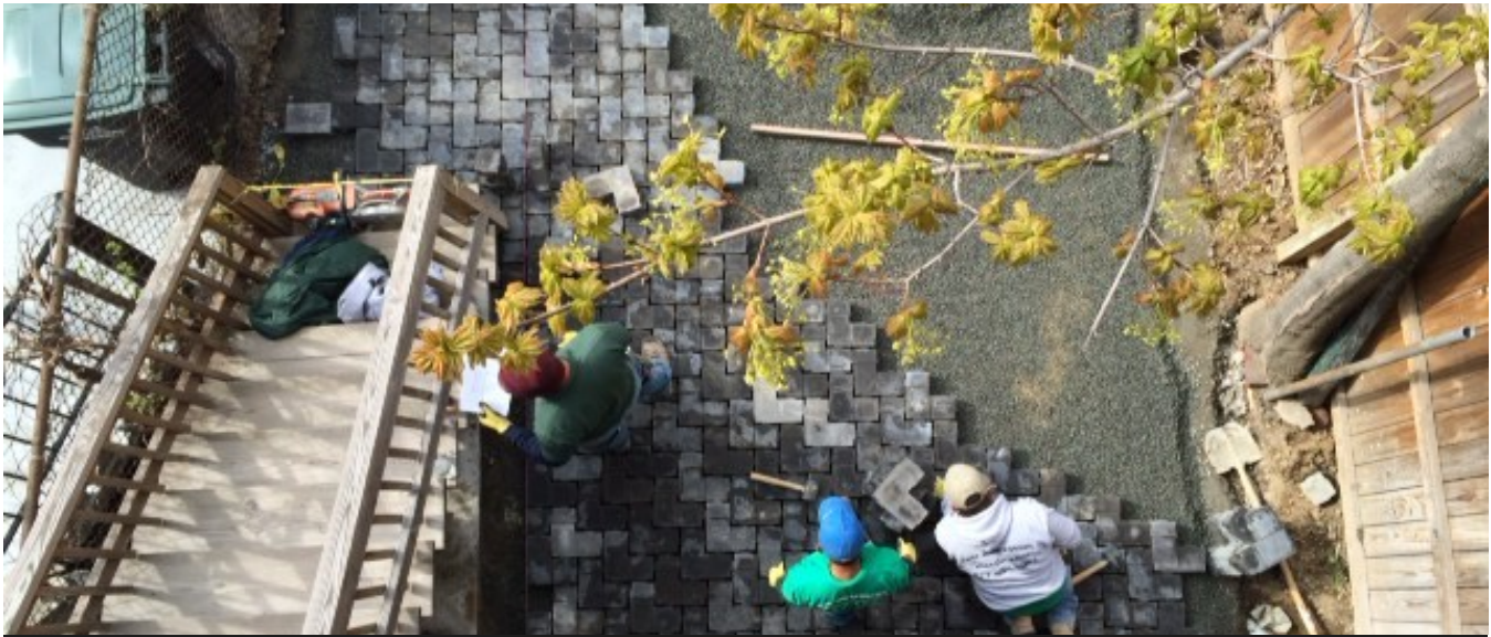
RiverSmart Pervious Paver Project in Progress