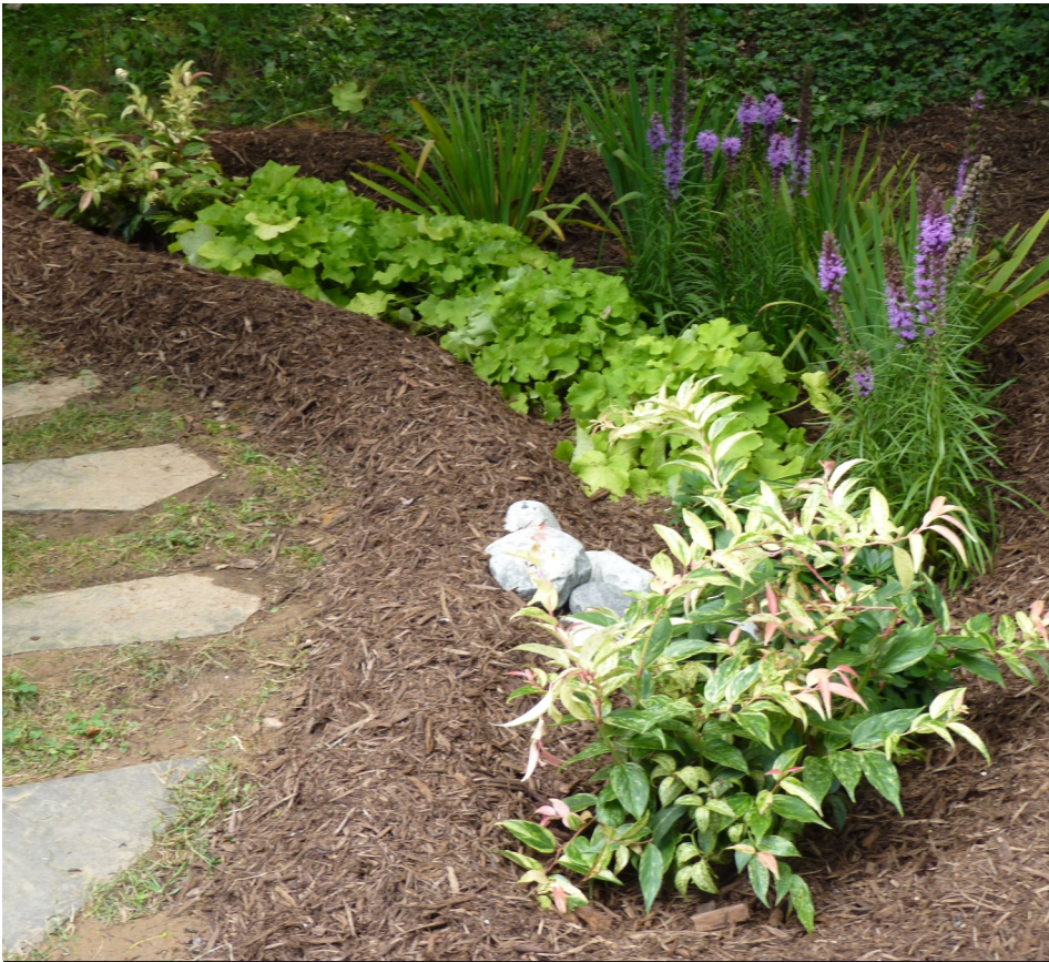
Mature RiverSmart Rain Garden