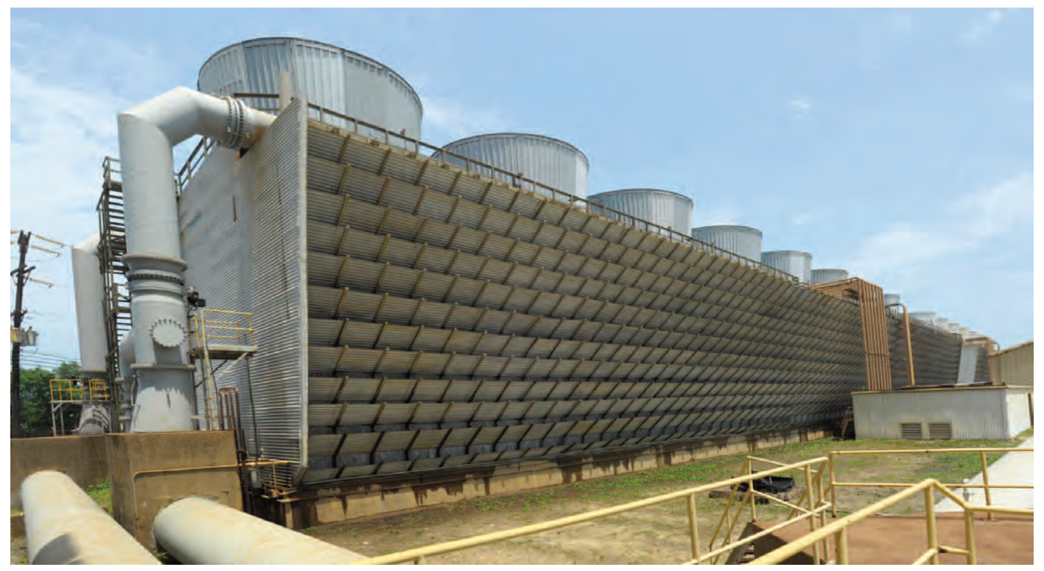
These cooling towers — part of the Benning Road Power Plant — will be dismantled and removed following closure of the plant. PES will arrange for the component materials to be reused, recycled or disposed of according to accepted environmental standards.