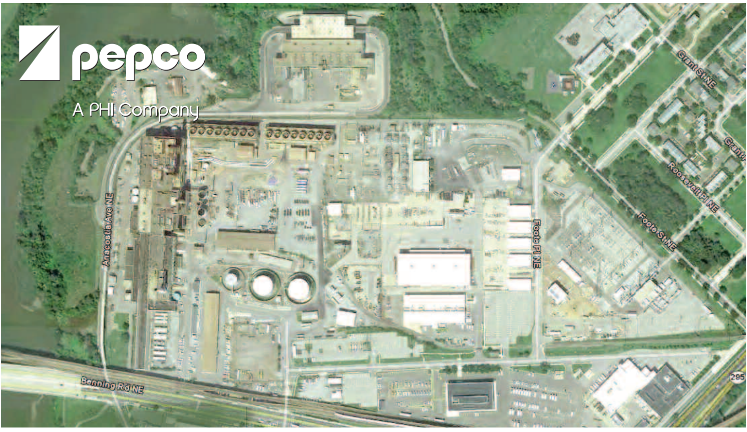
Aerial view of Pepco's Benning Road property.