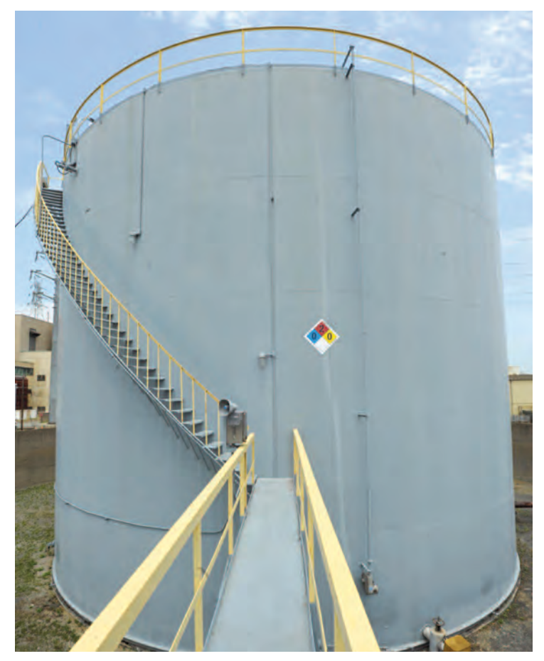
The fuel oil storage tanks that supply the Benning Road Power Plant will be dismantled and removed. Component materials will be properly reused, recycled or disposed of.

Columbia and U.S. Government agencies for decommissioning the power plant and its associated systems. PES is currently seeking the necessary permits and authorizations from District agencies to remove certain equipment, such as the fuel tanks and the cooling towers, upon closure of the plant. In addition, PES has identified the activities required to decommission the power plant in compliance with all safety and environmental regulations and is pursuing those activities that can be performed in advance of the power plant's closure. At the conclusion of power production operations, PES also will terminate the environmental permit to operate a power plant at the Benning Road facility. Until the power plant is closed, PES continues to operate in full compliance with the Clean Air Act, Clean Water Act and all other applicable District and Federal regulations.