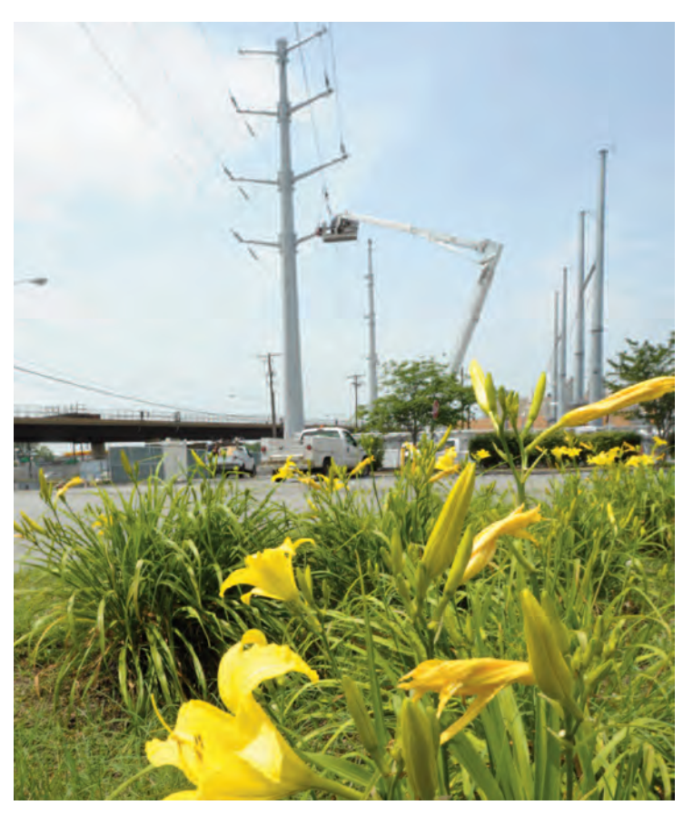
This rain garden is part of Pepco's low-impact development program of storm water management. The garden's natural filtration reduces any impact on the river.