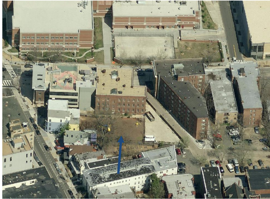
View of the site looking north