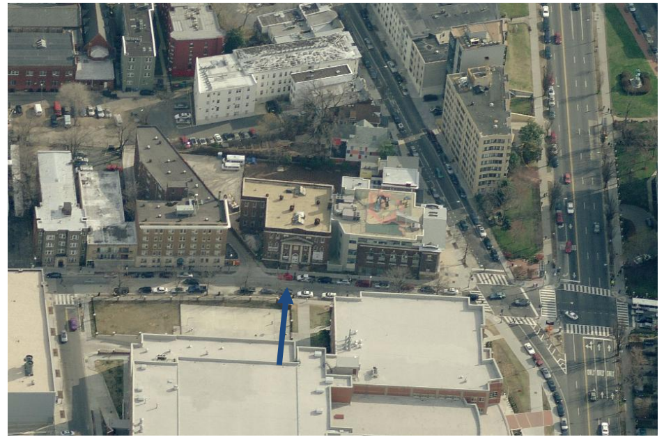
View of the site looking south (across Irving Street)