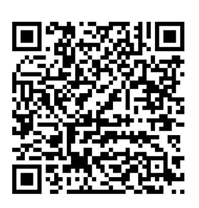
This QR Code shall: Not collect, analyze, or sell any personally identifiable information.