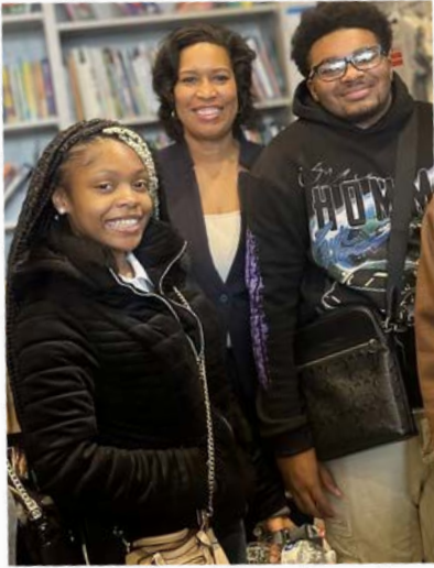
Mayor Bowser and KIPP DC College Preparatory Students