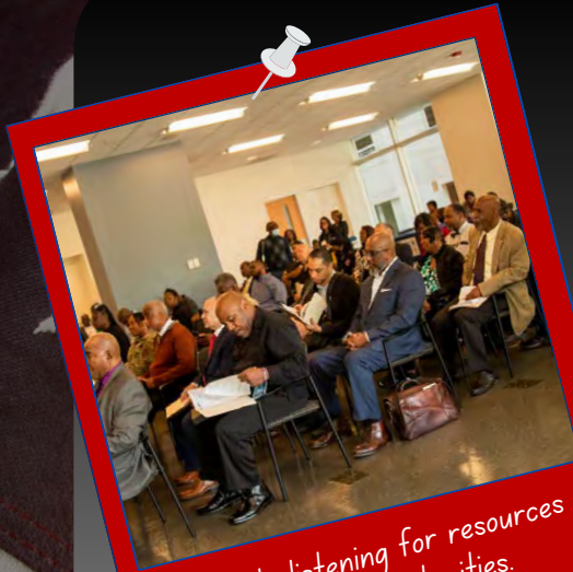
Residents listening for resources and local opportunities.

To learn more about our services, visit does.dc.gov .