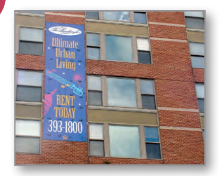
Penn Quarter Housing

the street's role as a pedestrian-oriented space linking the National Archives and National Portrait Gallery should be emphasized. Its potential as a large, flexible, programmable open space should be recognized. 1612.10