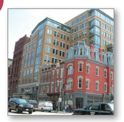
Atlantic Building, Downtown

buildings originally designed for other functions. Residential growth shifted to new neighborhoods to the north, east, and south. 1601.3