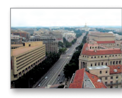
The "federal" city and "domestic" city should be connected as one, as they are in other great national capital cities.

The DC Circulator has been an important step to connect Central Washington destinations to one another, but additional improvements are needed. Improving east-west and north-south circulation, and improving parking management continue to be high priorities. Supporting Metro's efforts to increase capacity especially at Metro Center—also should be a priority.