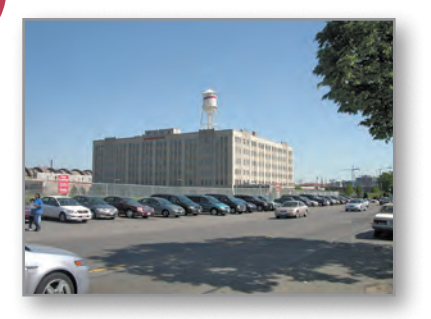
While NoMA is far from a blank canvass, its parking lots, open storage yards, and vacant sites present the opportunity for thousands of new homes, millions of square feet of office space, and great new parks and public buildings.

moving eastward toward Capitol Hill. This trend accelerated after 2000 with the opening of Metrorail's first "infill" station at New York Avenue, the renovation of a historic printing plant in Eckington as the new headquarters of XM Satellite Radio, the leasing of more than one million square feet at Station Place (1<sup>st</sup> and F Streets NE) to the U.S. Securities and Exchange Commission, and the development of a new headquarters facility for the Bureau of Alcohol Tobacco and Firearms at 1<sup>st</sup> Street NE and New York Avenue. <sup>1618.3</sup>