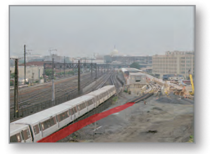
View to U.S. Capitol along CSX tracks