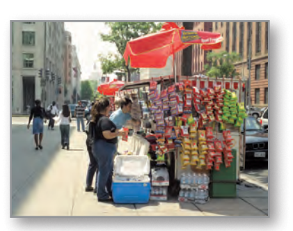
Street vendor, North Capitol Street