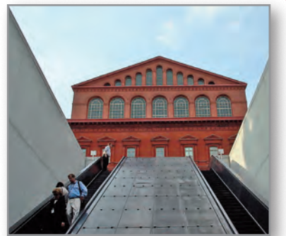
National Building Museum

On the eastern side of this Focus Area, Lower 16<sup>th</sup> Street has a unique and historic character that sets it apart from the area around it. The five blocks between H Street NW and Scott Circle are the ceremonial gateway to the White House and provide significant vistas of the White House and Washington Memorial. The street's green space and exceptionally