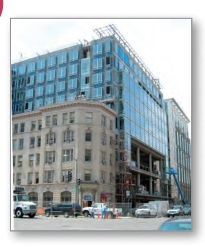
Recent Downtown construction

floor, approximately 16 feet in height subject to coordination with federal security needs, to the Hay-Adams Hotel. 1608.11