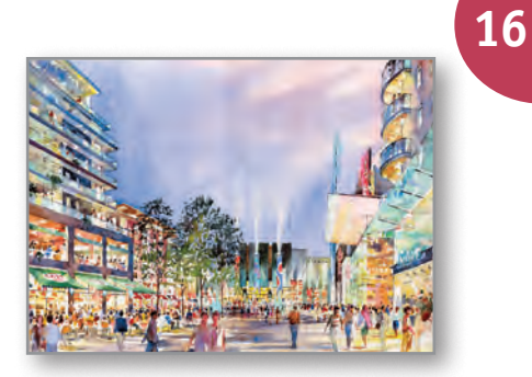
Illustrative Rendering of Possible Old Convention Center Site Reuse (2004)

Review land use, zoning, and urban design regulations for the Downtown retail district to ensure that they are producing the desired results, including continuous ground floor retail space, pedestrian-friendly streetscapes, adaptive reuse of historic buildings, and increased patronage by visitors and workers. 1611.15