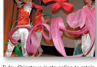
Today Chinatown is struggling to retain its identity as the area around it booms with new retail, office, entertainment, and housing development.

Conduct a "best practices" study that analyzes what other cities have done to conserve ethnic business districts (particularly central city "Chinatowns"),