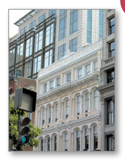
Seventh Street NW

See also the Economic Development Element for additional policies related to growth of the office economy.