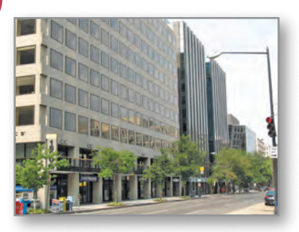
Over the next 20 years, housing and retail uses should be considered in this area to balance the office concentration and create after-hours street life. The area has some of the best transit access in the city, with four Metrorail stations.

wide right-of-way (40 feet between the sidewalks and property lines) are a defining element of its character. In addition, the corridor includes notable architecture and a mix of uses, including high-density housing. It is currently under consideration for historic district designation. 1616.3