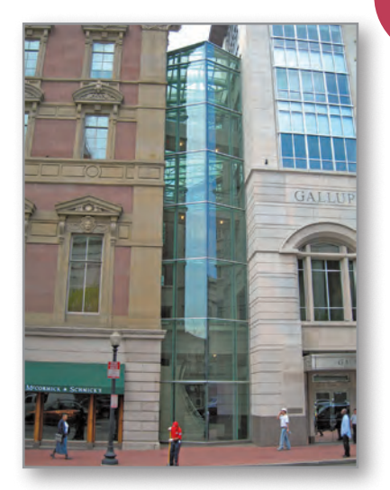
Gallup Building at 9th and F Streets

Encourage the development of additional hotels in Central Washington, especially in the areas around the new Convention Center and Gallery Place, along Pennsylvania Avenue NW and Massachusetts Avenue NW, in the Thomas Circle area, and in the area east of Third Street NW. A range of hotel types, including moderately priced hotels, and hotels oriented to family travelers as well as business travelers, should be encouraged. Hotels generate jobs for District residents and revenues for the general fund and should be granted incentives when necessary. Retain existing hotel uses by allowing and encouraging the expansion of those uses, including the addition of one