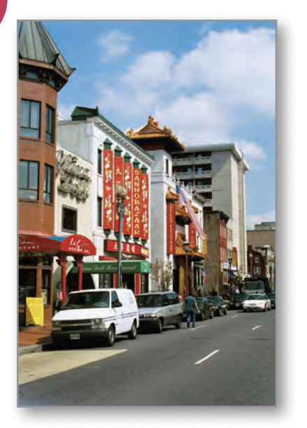
H Street NW, Chinatown

continued strong leadership will be needed to create the desired mix of uses.