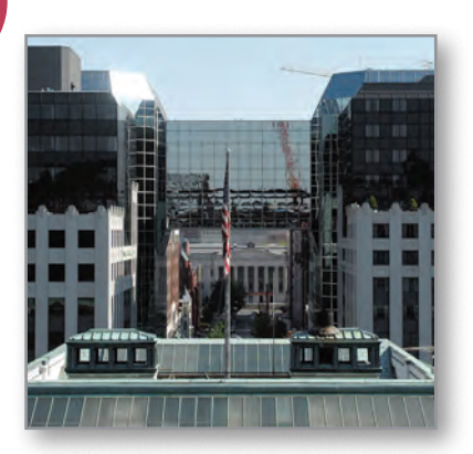
View corridor from Mt. Vernon Square south to National Portrait Gallery

adjacent to the Convention Center to minimize impacts on the surrounding neighborhood. <sup>1614.8</sup>